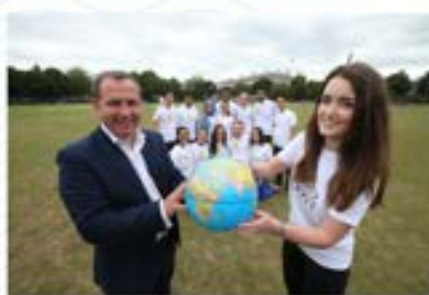
Charity initiatives, including partnerships with Diabetes Ireland and the Trinity College DOVE scheme.